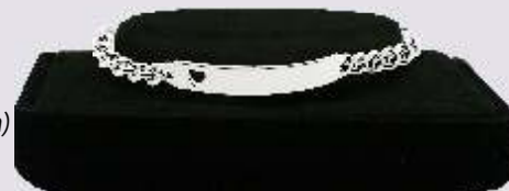
261120 Silver Plated Women's Bracelet With Heart Cut-Out: Engraving area: 1 1/3" x 1/4" (3.4 x .6 cm)