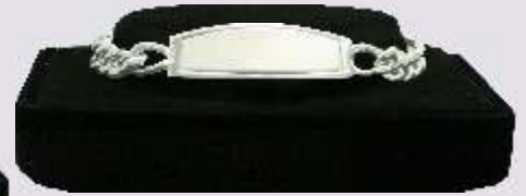
992025 Silver Plated Men's Classic ID Bracelet: Engraving area: 1" x 1/2" engraving area (2.5 x 1.3 cm)