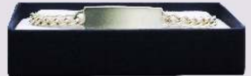
992032 Silver Plated Child's Classic ID Bracelet: Engraving area: 1" x 1/2" (2.5 x 1.3 cm)