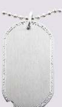
912301 Large Pewter Dog Tag With Rope Border Design: 2" x 1" (5.1 x 2.5 cm)