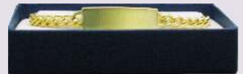
992033 Gold Plated Child's Classic ID Bracelet: Engraving area: 1" x 1/2" (1.5 x 1.3 cm)