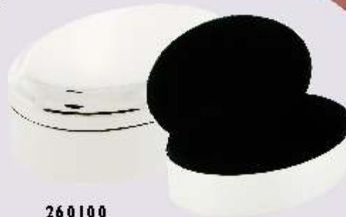
260100 Silver Plated Oval Box: Size: 4 1/2" x 2 3/4" (11.4 x 7 cm)