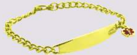
212430 Gold Plated Women's Medical ID With Charm: Engraving area: 1 1/4" x 1/2" (3.2 x 1.3 cm)