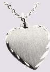
117000 Pewter Heart Pendant: 5/8" x 5/8" (1.5 x 1.5 cm)