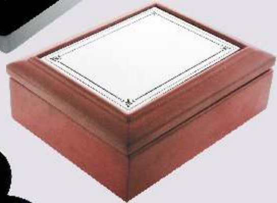
270000 Mahogany Jewelry Box with Pewter Plate: Size: 4 3/4" x 1 3/4" (12 x 4.5 cm)