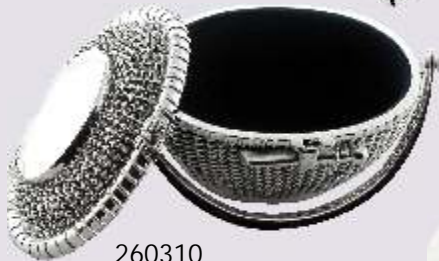
260310 Silver Plated Nantucket Basket Box With Handle & Removable Lid: Non-tarnish Size: 3" x 4" (7.6 x 10 cm)