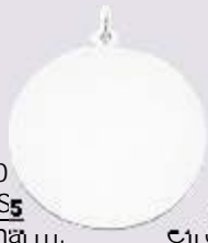
480005 Sterling Silver Circle Charm: 1/2" (1.3 cm)