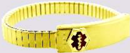
102465 Gold Plated Men's Medical ID With Stretch Band: Engraving area: 1 1/4" x 1/2" (3.2 x 1.3 cm)