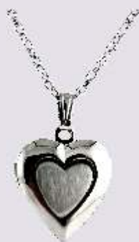
Mini Pewter Heart Locket: 3/4" x 3/4" (1.9 x 1.9 cm)