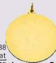
92037 9g Gold Plated Circle Charm: 1/2" (1.3 cm)