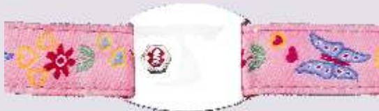
992035 Baby Girls's Medical ID Bracelet: Engraving area: 3/4" x 3/4" (2 x 2 cm)