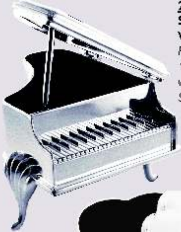
220240 Silver Plated Piano Jewelry Box With Fixed Keys & Prop-Open Lid: Plays "Music of the Night" or "Over the Rainbow" when wound with bottom key: Size: 5" x 4 1/2" (12.7 x 11.4 cm)