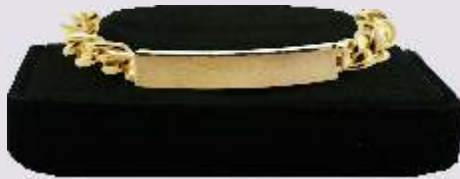
113530 Gold Plated Men's ID Bracelet: Engraving Area: 1 3/4" x 1/2" (4.5 x 1.3 cm)