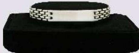
992027 Brushed Steel Men's Tech. One ID Bracelet: Engraving Area: 1 3/4" x 1/2" (4.5 x 1.3 cm)