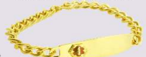
110230 Gold Plated Men's Medical ID Bracelet: Engraving area: 1 1/4" x 1/2" (3.2 x 1.3 cm)