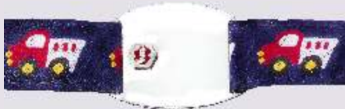
992036 Baby Boy's Medical ID Bracelet: Engraving area: 3/4" x 3/4" (2 x 2 cm)