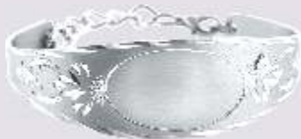
668000 Pewter Cuff with Design & Chain: Engraving area: 1" x 3/4" (2.5 x 1.9 cm)