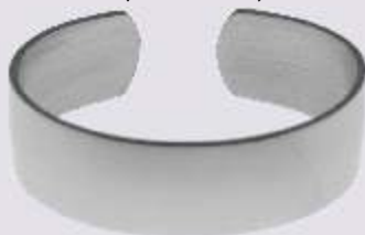
456000 Pewter Cuff Bracelet: 2 1/2" x 1 5/8" (6.4 x 4 cm)