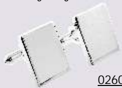
026020 Silver Plated Rectangle Cufflinks: Engraving Area: 1/2" x 3/4" (1.3 x 1.9 cm)