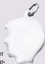
443000 Sterling Silver Girl's Head Char- 1/2" (1.3 cm)