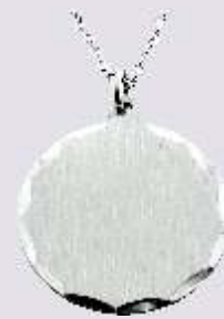
880000 Pewter Circle Pendant: 1" Diameter (2.5 cm)