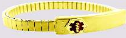
713650 Gold Plated Women's Medical ID Bracelet With Stretch Band: Engraving area: 1" x 3/8" (2.5 x 1 cm)