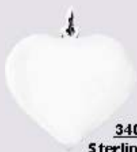
300 340g S5 Sterling Charm: 1/2" (1.3 cm)