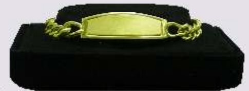
992026 Gold Plated Men's Classic ID Bracelet: Engraving area: 1" x 1/2" (2.5 x 1.3 cm)