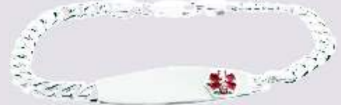
434612 Sterling Silver Man's Medical ID Bracelet: Engraving area: 1 1/2" x 1/2" (3.6 x 1.3 cm)