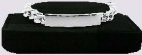
113520 Silver Plated Men's ID Bracelet: Engraving Area: 1 3/4" x 1/2" (4.5 x 1.3 cm)