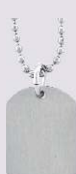
912400 Small Pewter Dog Tag: 1 1/2" x 3/4" (3.6 x 2 cm)