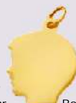
992039 Gold Plated Girl's Head Charm: 1/2" (1.3 cm)