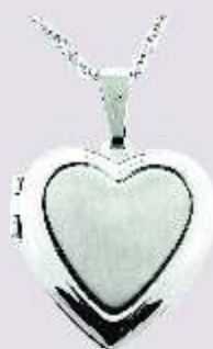
116000 Pewter Heart Locket: 1" x 7/8" (2.5 x 2 cm)