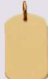
902041 Gold Plated Dog Tag: 2" x 1" (5.1 x 2.5 cm)