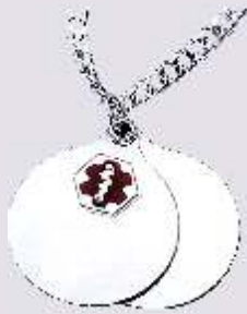
116405 Medical ID Necklace: 3/4" Diameter (2 cm)