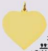
2038 99g Plat Heart Charm: 1/2" (1.3 cm)