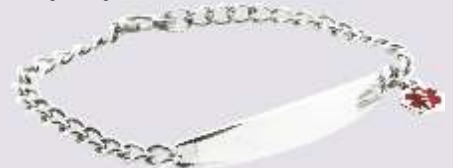
212400 Silver Plated Women's Medical ID With Charm: Engraving area: 1 1/4" x 1/2" (3.2 x 1.3 cm)