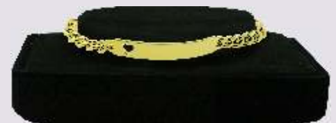
261130 Gold Plated Women's Bracelet With Heart Cut-Out: Engraving area: 1 1/3" x 1/4" (3.4 x .6 cm)