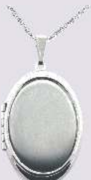
112000 Pewter Oval Locket: 1 1/2" x 1" (3.8 x 2.5 cm)