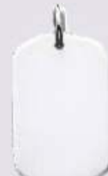
902044 Sterling Silver Dog Tag: 2" x 1" (5.1 x 2.5 cm)