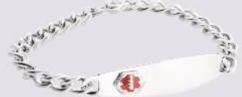
110200 Silver Plated Men's Medical ID Bracelet: Engraving area: 1 1/4" x 1/4" (2.2 x 1.2 cm)