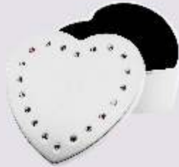
035310 Pewter Heart Box with Crystals: Velvet Lining: Size: 2 1/2" (6.4 cm)