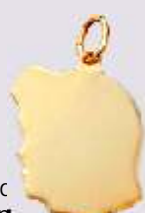
992040 Gold Plated Boy's Head Char- 1/2" (1.3 cm)