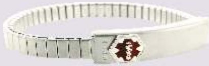
713050 Stainless Steel Women's Medical ID Bracelet With Stretch Band: Engraving area: 1" x 3/8" (2.5 x 1 cm)