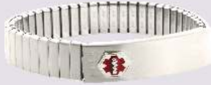
102405 Stainless Steel Men's Medical ID With Stretch Band Engraving area: 1 1/4" x 1/2" (3.2 x 1.3 cm)