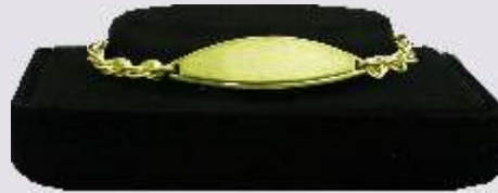
992024 Gold Plated Women's Oval ID Bracelet: Engraving area: 1" x 1/2" (2.5 x 1.3 cm)