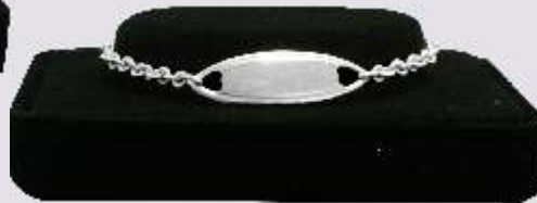
992031 Silver Plated Girl's ID Bracelet With 2 Heart Cut-Outs: Engraving area: 3/4" x 1/2" (1.9 x 1.3 cm)