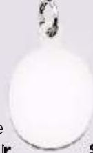
992043 Sterling Silver Oval Charm: 5/8" x 1/2" (1.5 x 1.3 cm)