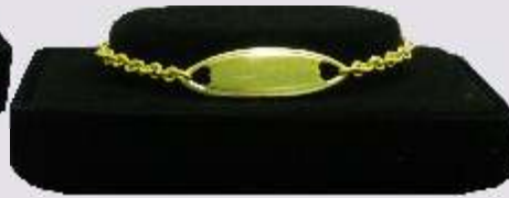
992030 Gold Plated Girl's ID Bracelet With 2 Heart Cut-Outs: Engraving area: 3/4" x 1/2" (1.9 x 1.3 cm)