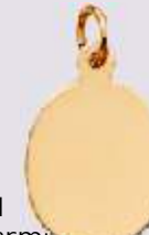
992042 Gold Plated Oval Charm: 5/8" x 1/2" (1.5 x 1.3 cm)