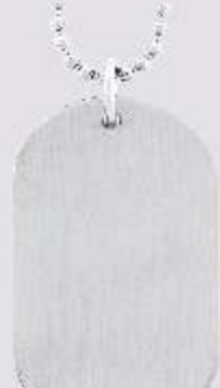
912300 Large Pewter Dog Tag: 2" x 1" (5.1 x 2.5 cm)