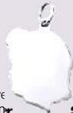
440000 Sterling Silver Boy's Head Char- 1/2" (1.3 cm)